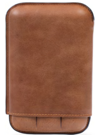
MODEL 3-cigar case COLOUR Cookie Brown SIZE 14 x 9 x 3 cm (closed) MATERIAL Matt vintage-style leather HOLDS 3 cigars - up to 21cm x 60Ø REF #310180