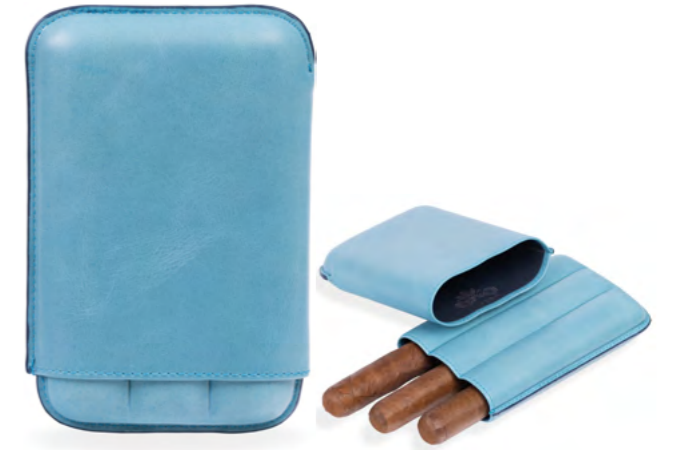
MODEL 3-cigar case COLOUR Turquoise Blue SIZE 14 x 9 x 3 cm (closed) MATERIAL Matt vintage-style leather HOLDS 3 cigars - up to 21cm x 60Ø REF #310159