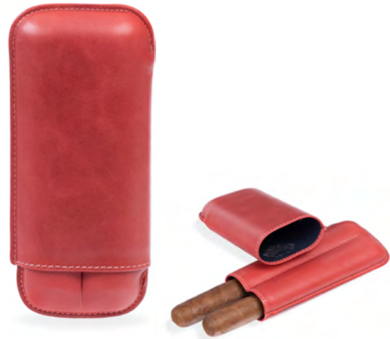
MODEL 2-cigar case COLOUR Berry Red SIZE 14,5 x 6,5 x 3 cm (closed) MATERIAL Matt vintage-style leather HOLDS 2 cigars - up to 21cm x 60Ø REF #310128