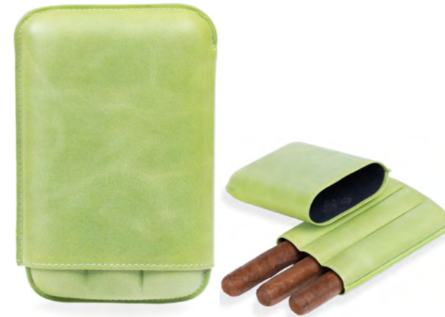
MODEL 3-cigar case COLOUR Apple Green SIZE 14 x 9 x 3 cm (closed) MATERIAL Matt vintage-style leather HOLDS 3 cigars - up to 21cm x 60Ø REF #310142