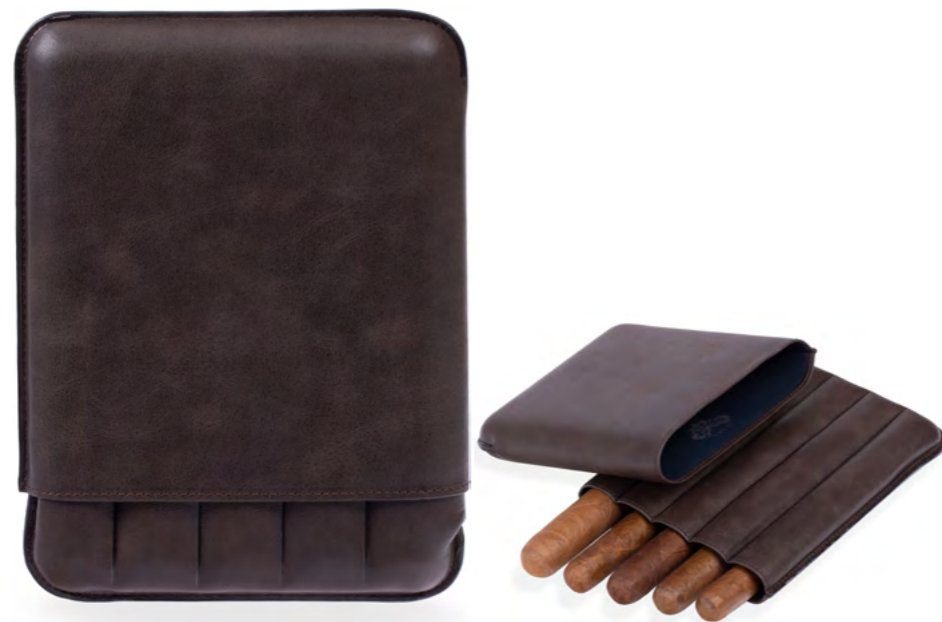
MODEL 5-cigar case COLOUR Peat Brown SIZE 19 x 14,5 x 3 cm (closed) MATERIAL Matt vintage-style leather HOLDS 5 cigars - up to 21cm x 60Ø REF #310197