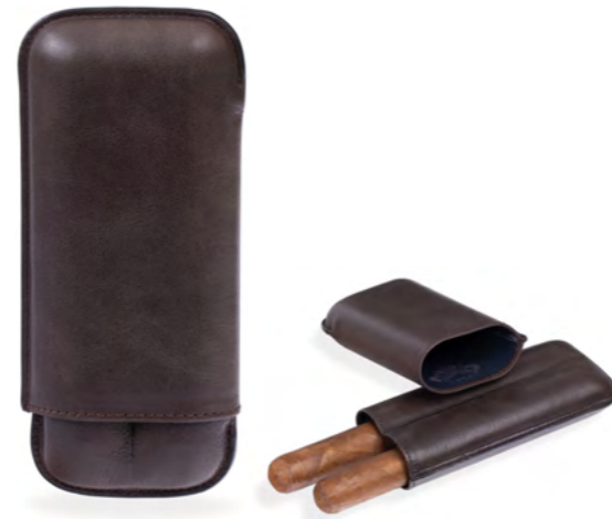
MODEL 2-cigar case COLOUR Peat Brown SIZE 14,5 x 6,5 x 3 cm (closed) MATERIAL Matt vintage-style leather HOLDS 2 cigars - up to 21cm x 60Ø REF #310135