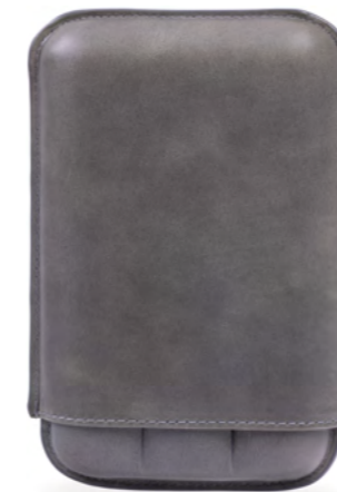
MODEL 3-cigar case COLOUR Pencil Grey SIZE 14 x 9 x 3 cm (closed) MATERIAL Matt vintage-style leather HOLDS 3 cigars - up to 21cm x 60Ø REF #310173