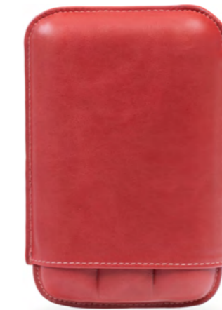
MODEL 3-cigar case COLOUR Berry Red SIZE 14 x 9 x 3 cm (closed) MATERIAL Matt vintage-style leather HOLDS 3 cigars - up to 21cm x 60Ø REF #310166